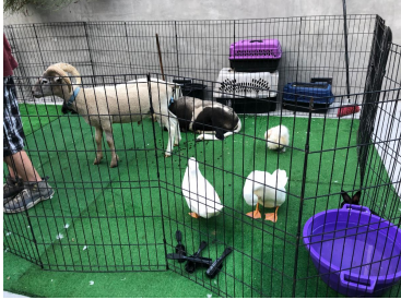
Petting zoo in Little Tokyo?!