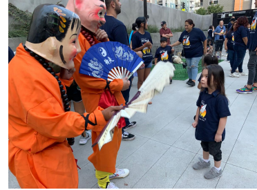
Child encounters jesters