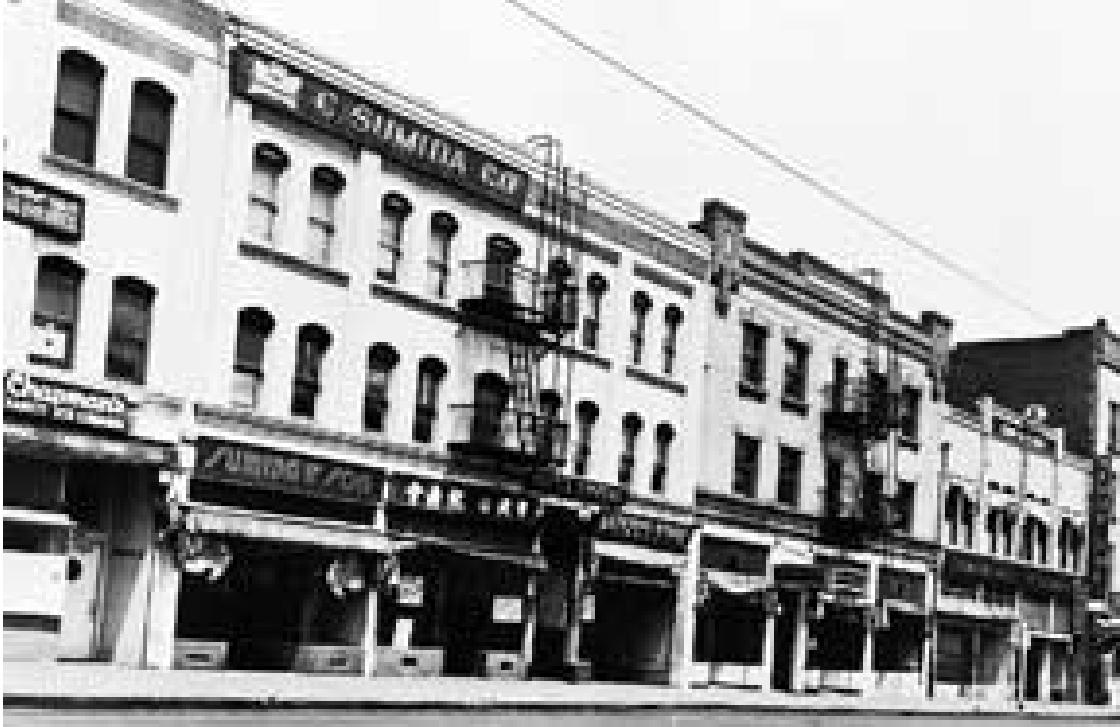
Little Tokyo during the Bronzeville period, 1942-46.