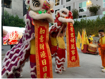
Shaolin Lion Dancers perform.