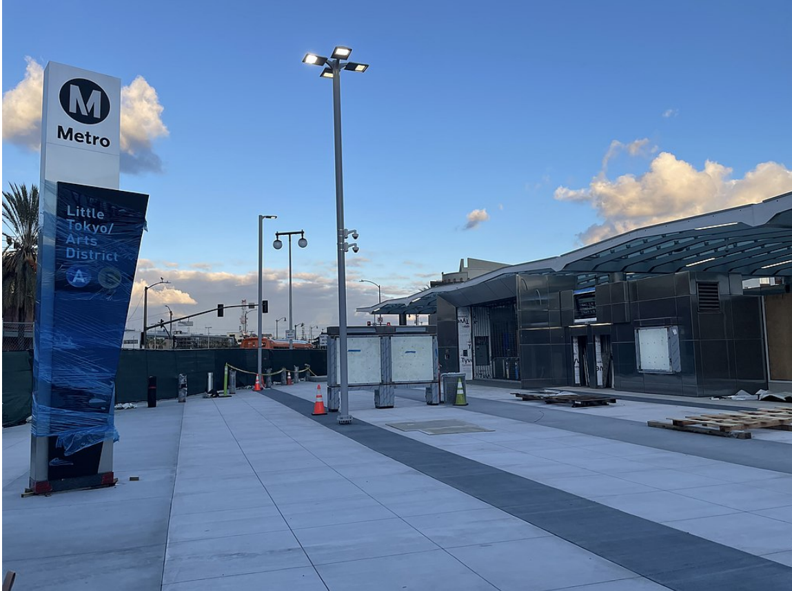
The Little Tokyo/Arts District Station as it looked in March.

A COMMUNITY BENEFIT PROGRAM OF THE LITTLE TOKYO BUSINESS ASSOCIATION QUARTERLY NEWSLETTER