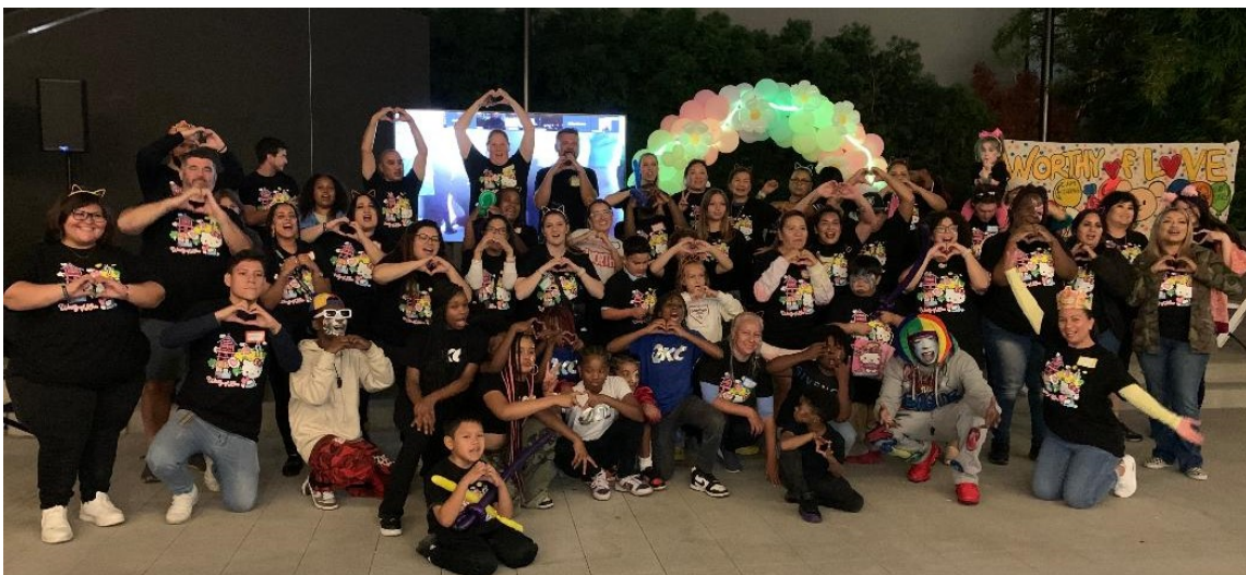
Gathered at the Terasaki Budokan, kids and volunteers make hand hearts for the camera.

*Please note that you can also register at the door on the day of the event.